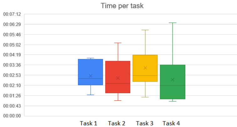
Figure 3: comparison of the timing per task using whisker-and-bar plot.