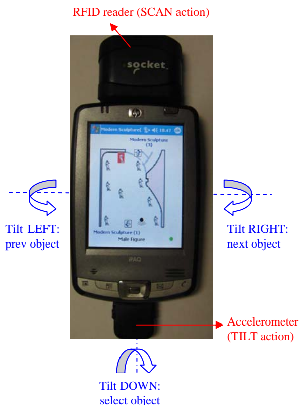
Figure 2: Example of scan and tilt interaction.

the room map is highlighted and its name is vocally rendered. In order to access the corresponding information, a vertical tilt must then be performed. Note that the current interpretation of the tilt event can also be enabled/disabled through a PDA button.