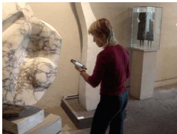
Figure 1: User in the Marble Museum with CICERO.

Our interaction technique for museum visitors has been applied to a previously existing application for mobile devices: Cicero (Ciavarella and Paternò, 2004). This is an application developed for the Marble Museum located in Carrara, Italy and provides visitors with a rich variety of multimedia (graphical, video, audio, ...) information regarding the available artworks and related items (see Figure 1).