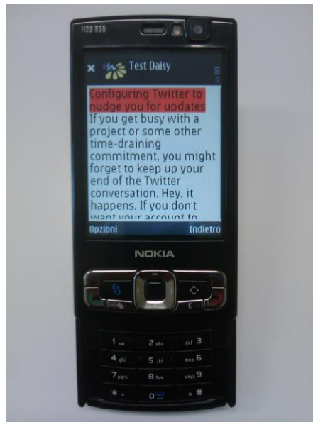
Fig. 5. Exporting in DAISY 3.0. Reading book content using a mobile screen reader.