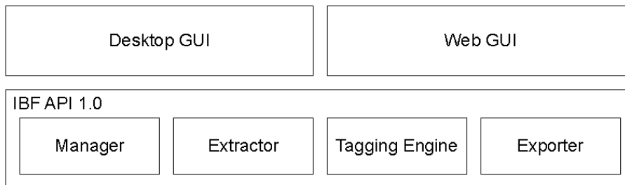
Fig. 3. IBF API 1.0 infrastructure.

The IBF API 1.0 is the core of our architecture and it is completely GUI independent. Fig. 3. shows the main infrastructure based on our solution. This means that developers can create both Desktop GUIs and web applications.