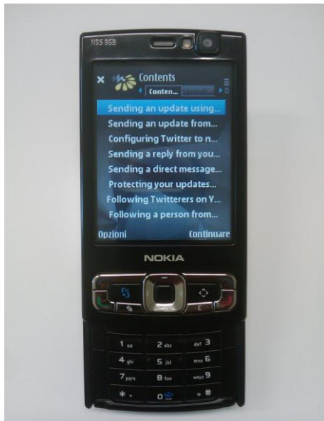
Fig. 4. Exporting in DAISY 3.0. Reading book index using a mobile screen reader.

The Exporter is the element that exports IBF file into final format such as XHTML 1.0 Strict or DAISY 3.0, by mainly using XSLT transformations. The flexibility of the Exporter is closely linked to the flexibility of XSLT: the new final format can be added by simply adding a new XSL Transformation. The final format XHTML 1.0 can be read through a common browser and a screen reader like Jaws 2 . The DAISY format can be read via a DAISY SW or HW reader. For example, Errore. L'origine riferimento non è stata trovata. shows the DAISY content obtained by extracting the book [18] by using Book4All. The DAISY version extracted by Book4All can be transferred to the symbian-based smartphone Nokia N95. A DAISY multimedia player 3 can be installed on the mobile phone. The DAISY player includes a voice synthesizer, which reads the XML- DAISY book without needing an additional screen reader loaded on the smartphone.